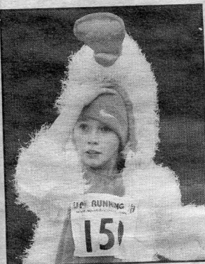
HAVE YOU GONE QUACKERS?: A young girl dressed as a duck took part in the Stoop Fell Race.

Over in Ireland, the traditional post-Christmas meeting at Leopardstown sees the appearance